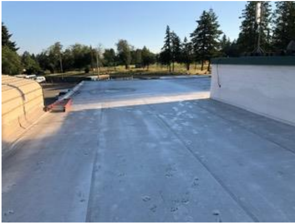
Left: Roof of raised section of building