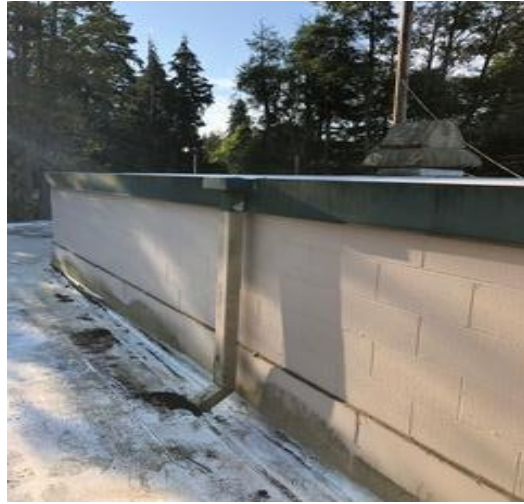
Right: L-section of roof, garage-building junction.